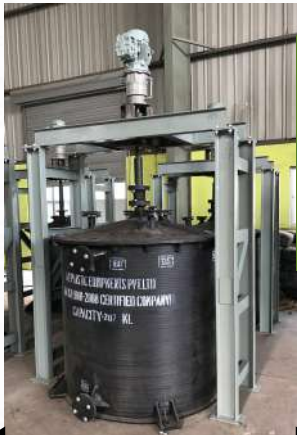
HDPE Reaction Vessel

Excellent chemical and corrosion resistance Seamless construction for leak-proof operation High durability with long service life Efficient mixing with agitator compatibility Suitable for handling acidic and alkaline media