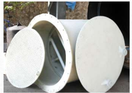
PP Nutsch Filter