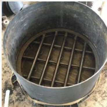
HDPE Nutsch Filter

Ideal for vacuum filtration processes Strong chemical resistance for harsh media Durable and lightweight construction Easy maintenance and long service life Customizable designs for various industrial applications