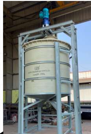
PP Reaction Vessel

Excellent chemical and corrosion resistance Seamless construction for leak-proof operation High durability with long service life Efficient mixing with agitator compatibility Suitable for handling acidic and alkaline media